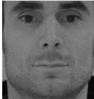
Fig. 1. Mock example of the pictures used in the experiment. Black and white version of the faces are cropped at the left and right facial boundaries, chin and top of the eyebrows.

Bonnefon et al. (2013). Because it was not feasible to run 60 rounds in the current study, we selected a subset of 14 pictures: 6 pictures of Abusers (3 males, 3 females), 2 pictures of Neutral players as fillers (1 male, 1 female), and 6 pictures of Cooperators (3 males, 3 females). Because the current study investigates a negative moderator (age) of the original trustworthiness detection effect, we maximized power by selecting pictures of Cooperators and Abusers that were highly discriminated in our original studies conducted in an adult population. That is, we selected the 3 male Cooperators and 3 female Cooperators who were best discriminated as such in previous studies, and the 3 male Abusers and 3 female Abusers who were best discriminated as such in previous studies.